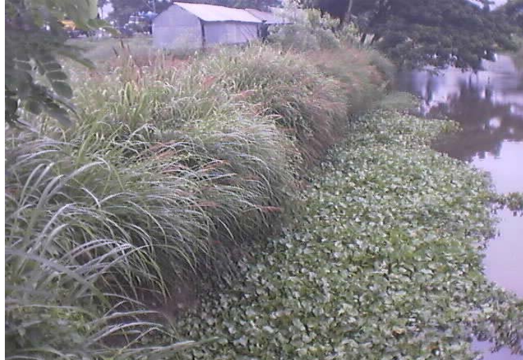
Fig 1: Vetiver growing naturally along the canal bank

Fig.1 shows the natural growth of vetiver along the canal bank at Comilla: