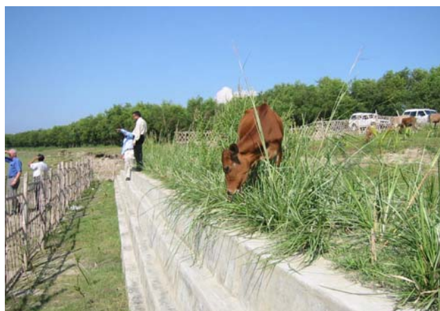
Fig. 6: Vetiver grass on Concrete Frame- toe protection wall

Fig. 7 shows another type of toe protection trial made with pre-cast concrete zigzag beams, placed in the eroded part inter-locking each other. Vetiver planted in the back filled-in soil in June 2002. The