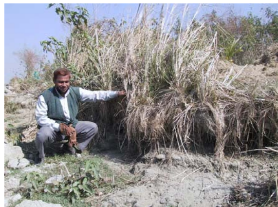
Fig.6 shows the well-grown vetiver with concrete frame (CF) toe protection trial at 62 Patenga (planted August 2001, Photo July 2002). It also shows that established Vetiver is browsing resistant.