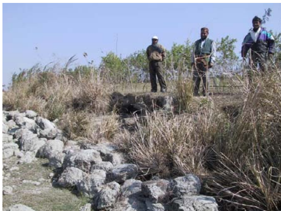
Fig. 4: Vetiver with soil-cement mixture bag, toe protection trial, Sandwip (1 year)