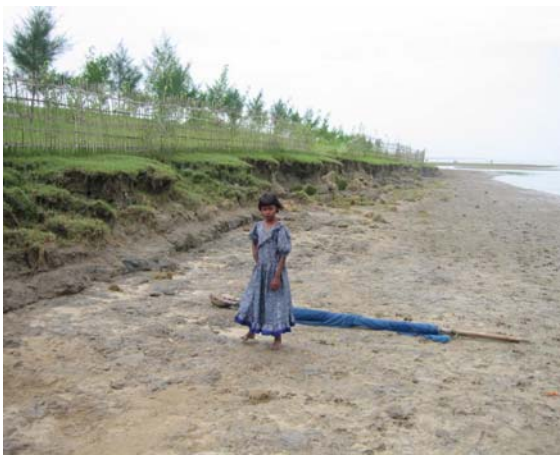
Fig 2: Creeping toe erosion