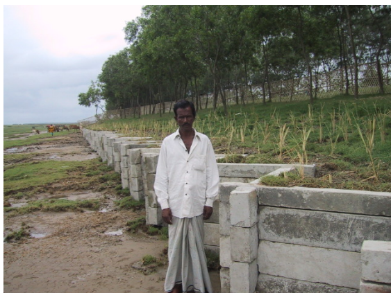
Fig. 7: Toe protection trial by zigzag RCC away by beams (June 02) 08, 2002)